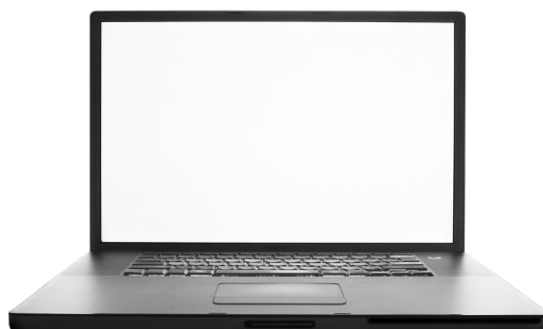
Figure 1. Caption for the figure.